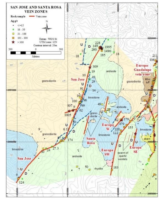
Figure 2. Geological map of the San José, Santa Rosa, and Europa Sur vein zones, Alamos Project. Note U (up) and D (down) symbols indicating relative displacement of fault blocks. Please click on map image to view in full size