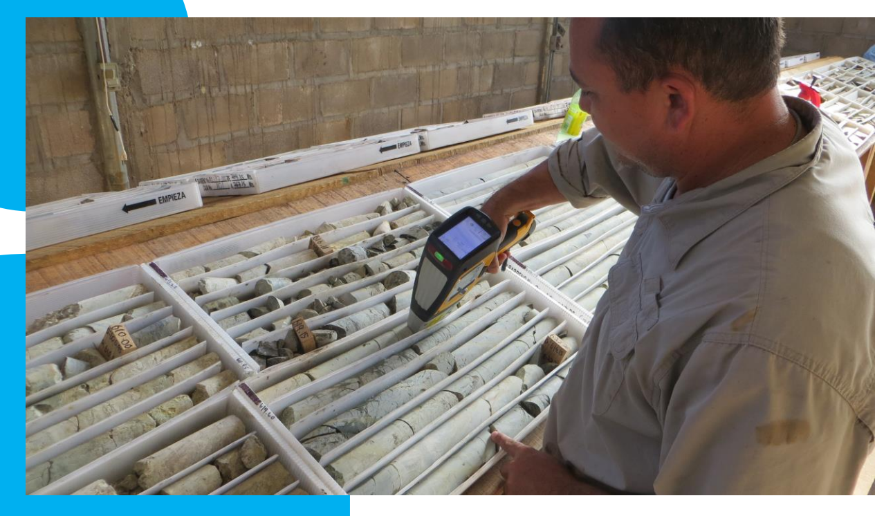
Mexican geologist at Minaurum's Alamos project core shack

Provides opportunity to the local members to acquire experience in the mining industry and expand their skillset as the Alamos project advances through the exploration cycle.